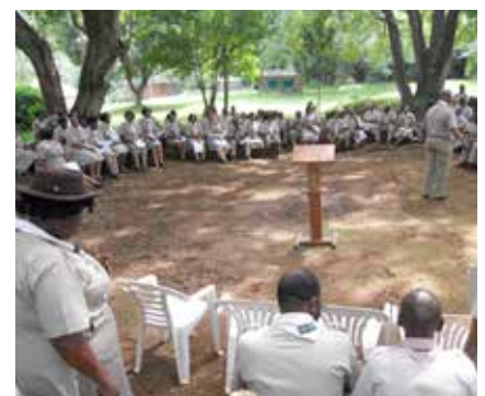
Goodenough addresses the new wood badge recipients.